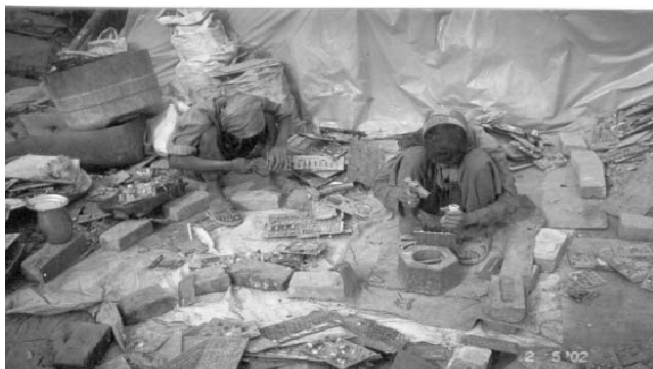
Fig.3 Children working with toxic waste

There are no harmless substances. There are only harmless ways of using substances. E-waste/ Industrial waste putting children at risk(Fig. 3) is estimated that 50 percent of all used e-waste is “dumped” into India, China and African countries, where it is a common practice for children (and some adults) to make money “backyard recycling” scrap electronic products over open fires to remove reusable components. Electronic waste is the major issue in India. It affects many people either directly or indirectly. E-waste/ Industrial waste creates a lot of economic and environmental losses to our country.